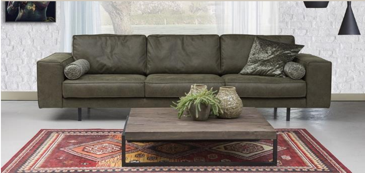
*Cherokee Olive (S1)